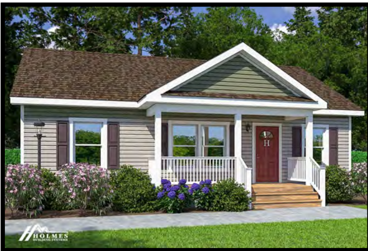
Elevation Shown with Optional and On-Site Builder Supplied Items. Consult Your Builder for Pricing.