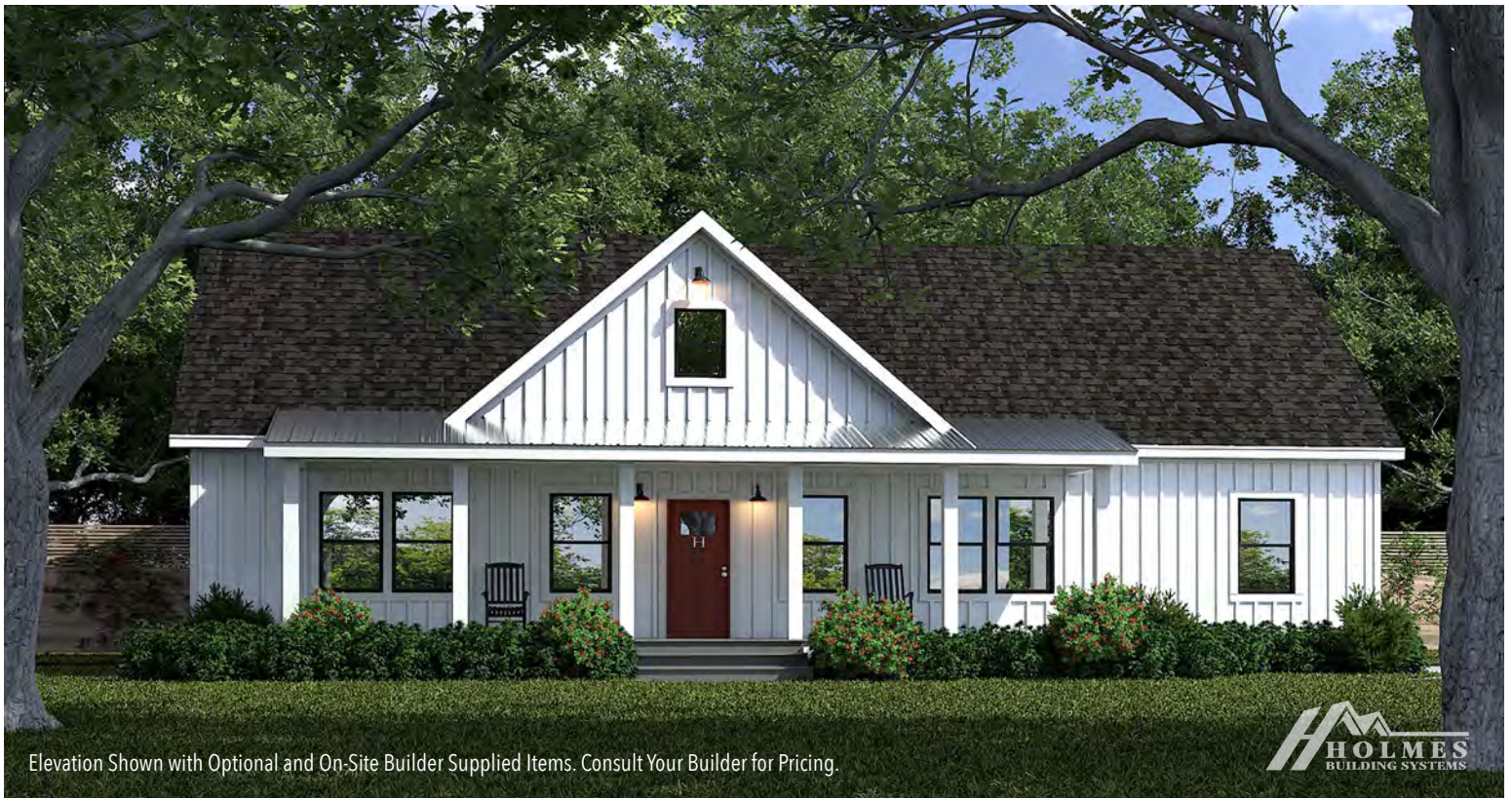
Elevation Shown with Optional and On-Site Builder Supplied Items. Consult Your Builder for Pricing.