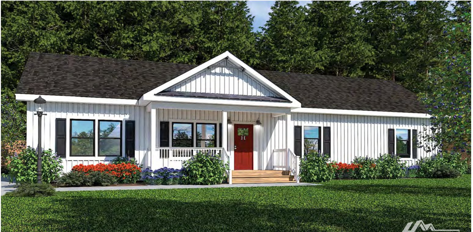
Elevation Shown with Optional and On-Site Builder Supplied Items. Consult Your Builder for Pricing.