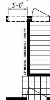
OPTIONAL BASEMENT EN