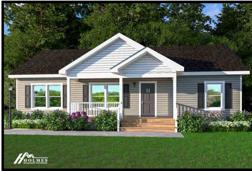
Elevation Shown with Optional and On-Site Builder Supplied Items. Consult Your Builder for Pricing.